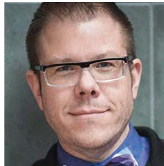
Trad A BURNS