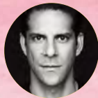
Marcelo Gomes International Ballet Star Former Principal Dancer, American Ballet Theatre