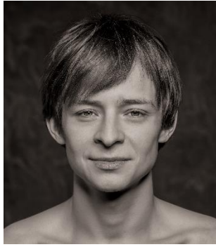
Photo 21: Daniil Simkin, Principal Dancer of American Ballet Theatre and Berlin Opera Ballet