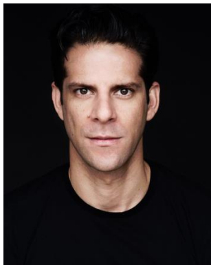
Photo 19: Marcelo Gomes, International Ballet Star and Former Principal Dancer of American Ballet Theatre