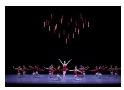
Photo 16: Van Cleef & Arpels Proudly Presents Balanchine's Jewels | Hong Kong Ballet Dancers | Photography: Conrad Dy-Liacco | Choreography by George Balanchine © The George Balanchine Trust | Courtesy of Hong Kong Ballet