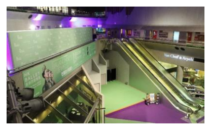
Photo 44: Van Cleef & Arpels Proudly Presents Balanchine's Jewels venue