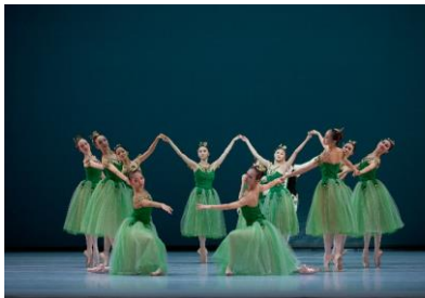
Photo 8: Van Cleef & Arpels Proudly Presents Balanchine's Jewels | Hong Kong Ballet Dancers | Choreography by George Balanchine © The George Balanchine Trust